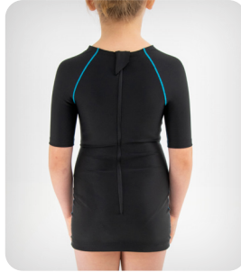
PCO-T-10 * Long compression dynamic suite with short sleeves