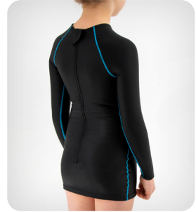
PCO-T-11 * Long compression dynamic suite with long sleeves