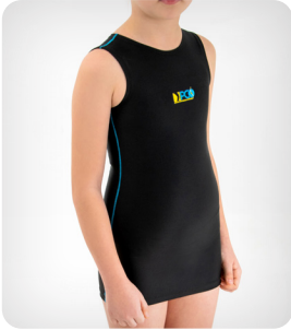
PCO-T-09 * Sleeveless long compression dynamic suite