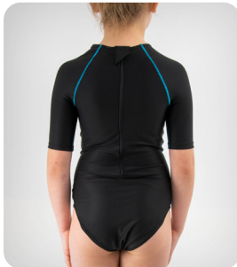
PCO-T-24 * Upper body compression dynamic suite with short sleeves