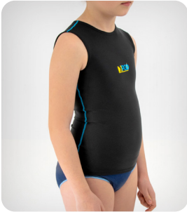
PCO-T-16 * Sleeveless short compression dynamic suite