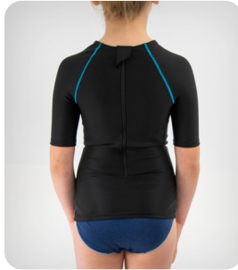
PCO-T-17 * Short compression dynamic suite with short sleeves