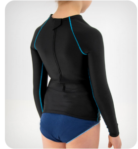
PCO-T-18 * Short compression dynamic suite with long sleeves